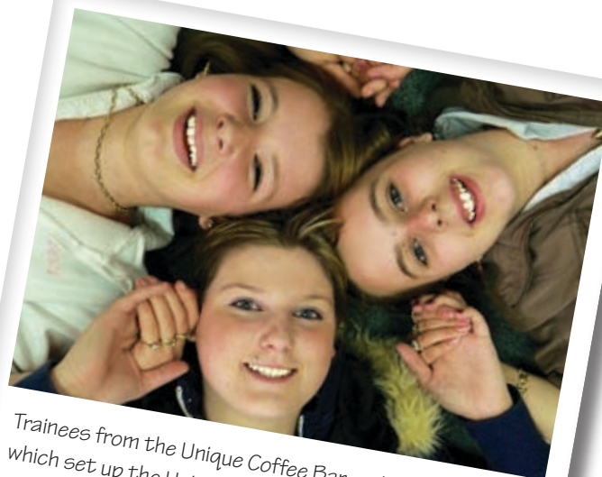
Trainees from the Unique Coffee Bar, a charity in Newark which set up the Unique Social Enterprise to benefit young people, the environment and the wider community.