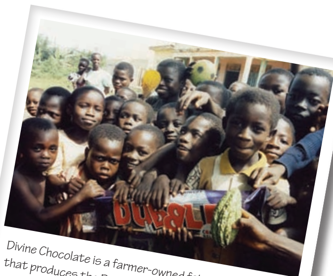
Divine Chocolate is a farmer-owned fair trade company that produces the Dubble and Divine chocolate bars.