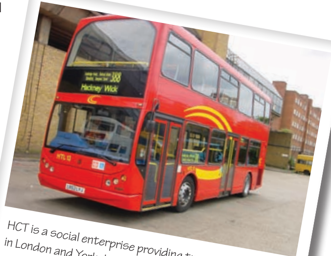
HCT is a social enterprise providing transport solutions in London and Yorkshire alongside community training services.